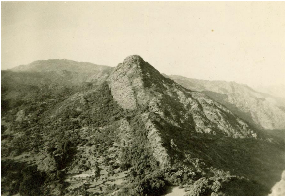
Plummy from on top of Spongy