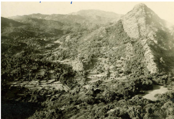
Plummy from Spongy – New Road Visible In Plummy Valley