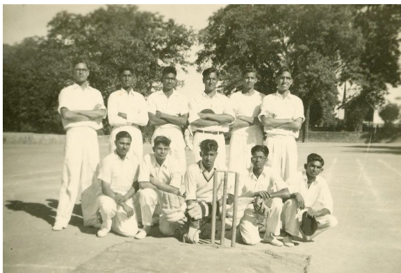
1956 School Cricket Team on Small Pitch