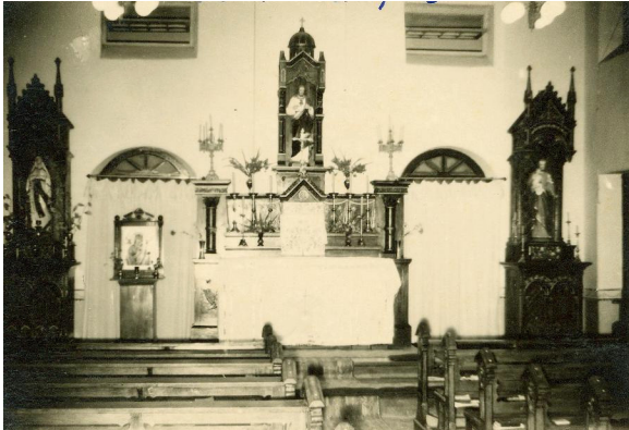
Old School Chapel Dedicated To Our Lady Of Perpetual Succour